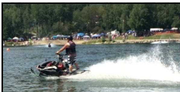
lone's Down River Days features a sled water cross. It's all good unless you sink!

kirk Trailblazers' Water Cross at Down River Days in Lone Washington. The snowmobile water cross once again was very successful with a large crowd in attendance. Always fun to see sleds on the water and the occasional sled sinking!