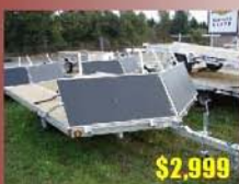
XTD11-101 TILT SNOWMOBILE TRAILER