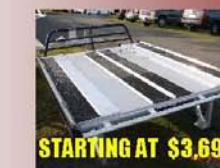
MARLON PRO 8FT SLED DECK