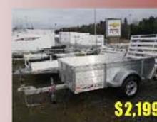
AUT853 UTILITY TRAILER