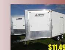
XTPRESTIGE 168 3 PLACE ENCLOSED SM TRAILER