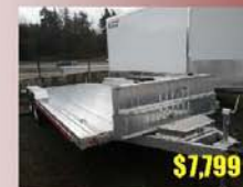
CH20 ALUM CAR HAULER