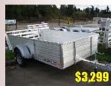
NEW TRITON AUT 1064