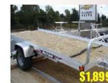
XT 4.5 10'x53" W