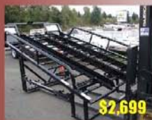
NEW MARLON UTV DECK