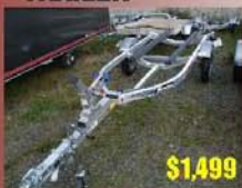
LTWC1- SINGLE WATERCRAFT TRAILER