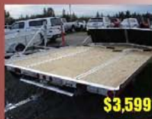
E12VR 12' SLED TRAILER