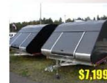
2019 TC128 ENCLOSED