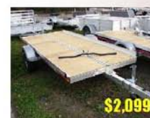
ELITE 5'x 12' TILT TRAILER