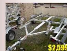
ELITE WCII 2 PLACE WATER- CRAFT TRAILER