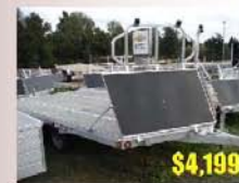
XT14-101-2EB 3 PLACE SLED/ 4 ATV