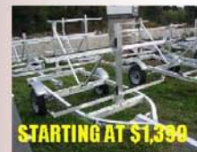
KAYAK/ CANOE TRAILER