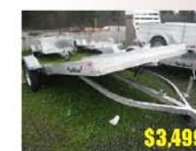
TILT 1282 UTV