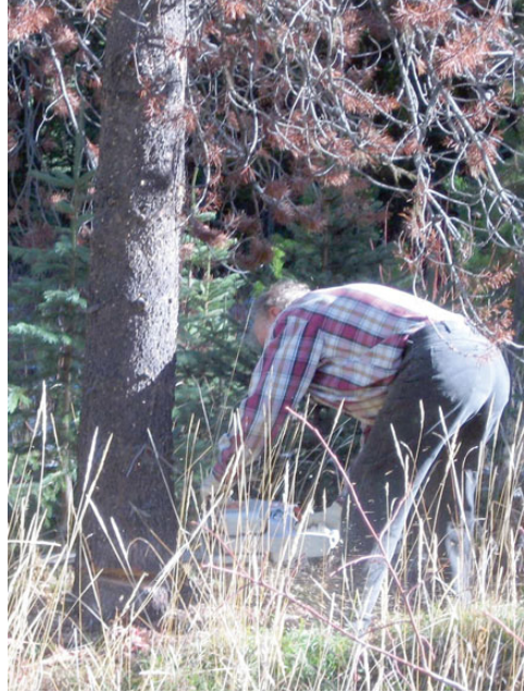
Cutting down bug-killed trees trailside; prevents blow downs and provides a source of heat too!