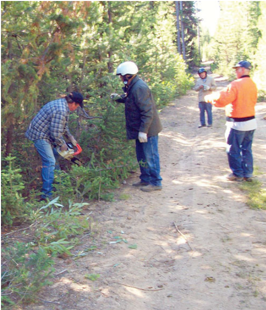
Club members clearing the trail on the Loup for the groomer.

The Tri-River Snowmobile Club received a WSSA Trail Grant in 2014 for performing maintenance and brushing on groomed and un-groomed trails on U.S. Forest Service and Washington Department of Natural Resources lands in Okanogan County. In addition, the Black Canyon Shelter was fully stocked with wood.