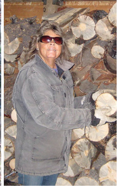
Local snowmobilers have the Tri-River club to thank when enjoying the warm Black Canyon Shelter.