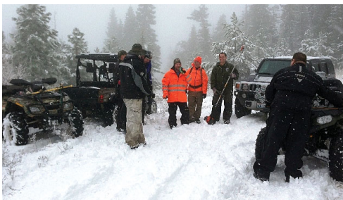
Not enough snow for the snowmobiles, but lots of fun with the saws and other toys!

Here we go again, another late snow year. One good thing about late snow... more time for trail work! Sky Riders have continued to have work parties to help improve the condition of trails out of our community and around the area.