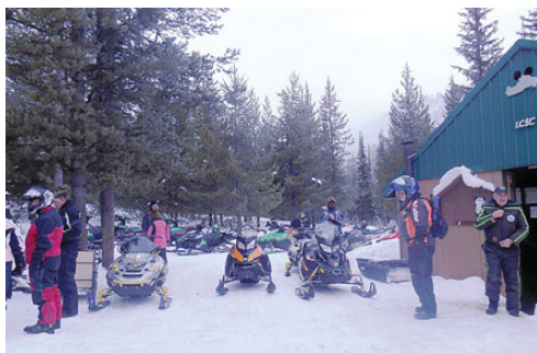
A great turnout at the chili feed with members of the Butte Busters and Methow Valley also in attendance.

The Tri-River Snowmobile Club hosted the Chili Feed at the Black Canyon Shelter and had a great turnout with lots of chili, hot dogs and cookies! We