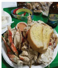
Wow, does this look good or what? Not a fan of crab? The alternative was prime rib!

With our Crab feed behind us, we are not so patiently waiting for snow. Several early birds have already been up but the rides were short and this past week what snow was there has turned to ice. The weather forecast doesn't offer much hope at least until the middle of January. However, we are now busy planning our annual SnoFest which is going to be held on Sunday, February 8th.