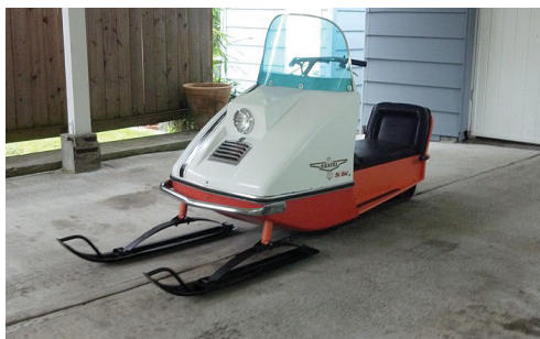
Whether old or new, our machines need maintenance and tweaking to keep them in tip top condition.

Where's the snow! According to tonight's forecast it is coming this week. This is the fourth week I was lead to believe that. It is not easy waiting for the season to start, especially if you are a vintage snowmobile guy with fourteen sleds.