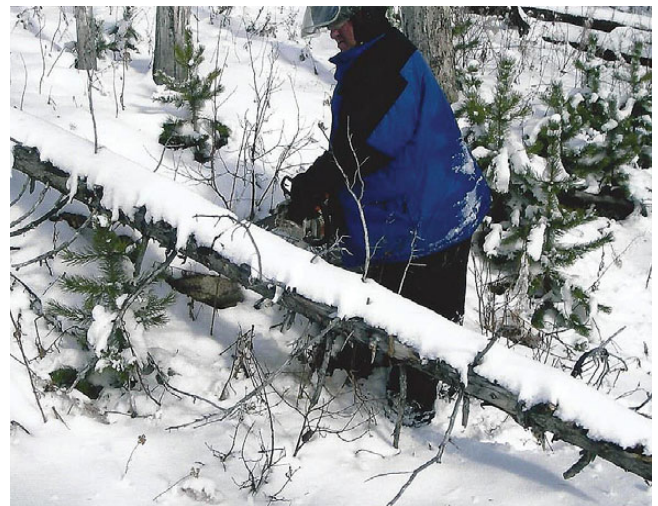
Bill Johnson removing downed trees on groomed trail route.

All groomed roads in the central county area were logged out by AOCSC volunteers in preparation for grooming operations. The trail grant will also assist the AOCSC in maintaining the snowmobile warming shelter located at Hunter Meadow on Washington State Department of Natural Resources (WDNR) land in the Loomis Forest of Northern and Central Okanogan County. This warming shelter was remodeled two years ago by AOCSC volunteers with money from a WSSA trail Grant, monetary donations from AOCSC volunteers, and lumber and other materials provided by WDNR.