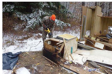
A Sawzall and members of the Sky Riders club are all that were needed to help DNR remove an abandoned camper.

The Sky Riders have been keeping plenty busy over the last month, logging over 250 volunteer hours in just a few weeks. Along with brushing trails, we were asked by the Department of Natural Resources (DNR) to help