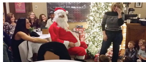
Apparently NWGC members were not so naughty this past year as Santa visited their Christmas party.

We have lots of events still planned for this sledding season and are just waiting for the snow to fall! Everyone is welcome to come join! We will be having Avalanche Training on January 24th at Ploeg's Place, 9am, on Mount Baker. This is very important for everyone to practice, no matter your level of experience. It is a great refresher course to keep you up to date with the latest gear and to be ready for anything!