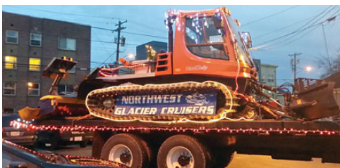
NWGC took advantage of low snow and an idled groomer and entered it in the local parade.

I hope everyone had a wonderful Merry Christmas and a Happy New Year. There has been very little snowfall as everyone knows, but it has not stopped the Northwest Glacier Cruisers (NWGC) from having a fun holiday season; everything from parades to a Christmas party that included Santa for the little ones. Thank you everyone who participated and helped make these events a great tradition for our club members of all ages.