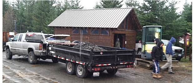
Rock was hauled 30 miles with some using their personal trucks to tow five-yard dump trailers.

For some odd reason, we always have people shooting up the hut. This hunting season some fool shot what seemed to be 20 or more holes through the metal roof and shot out a couple of light fixtures. This vandalism has been a yearly event. We sealed the holes in the roof.. again, replaced the broken light fixtures, replaced the stolen entry door snow grate, and put up a new stove pipe and top cap. I'm not sure how to prevent this senseless damage but thanks to the club, the hut is good as new.