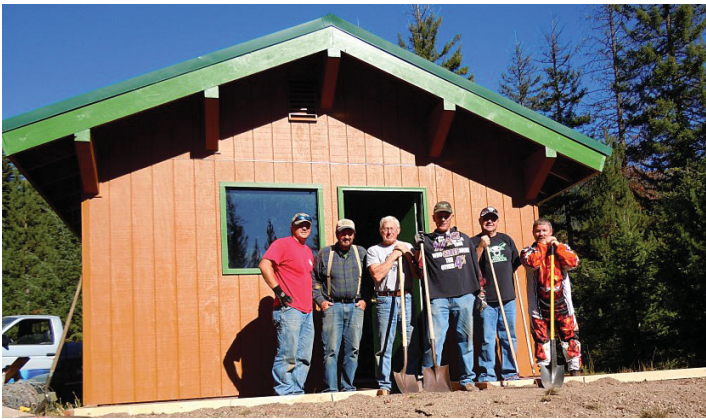
Methow Valley snowmobilers pulled together and upgraded the Black Pine shelter with a new concrete floor, new stove, and fresh paint. Way to go!

Snowmobiling is winter sports enthusiasts' number one sport across the Nation. Men, women, children of all ages and abilities love to rev up their engines and take off into the mountains, riding in all sorts of snow conditions. Local and state organizations continually stress the importance of safety, as accidents can 'ruin your whole day' for lots of people. One of the hazards of riding in the mountains is the availability of shelter, specifically a warm shelter, when needed.