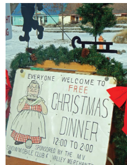
The Methow Valley Snowmobile Association continued their annual tradition of serving up a free Christmas dinner to those who needed it. Snowmobilers spreading the cheer!